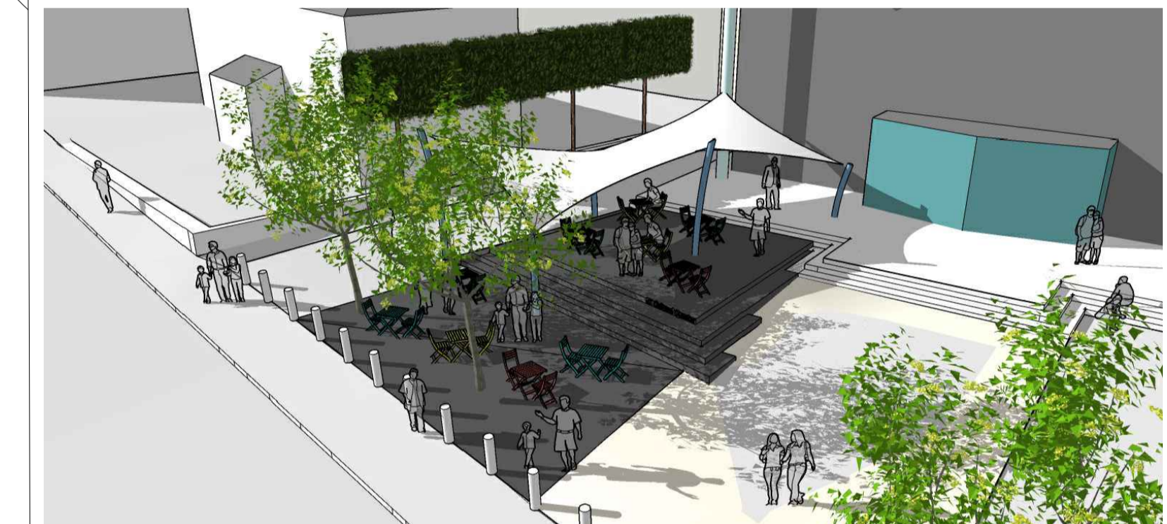
Illustrative Visualisation: View towards theatre