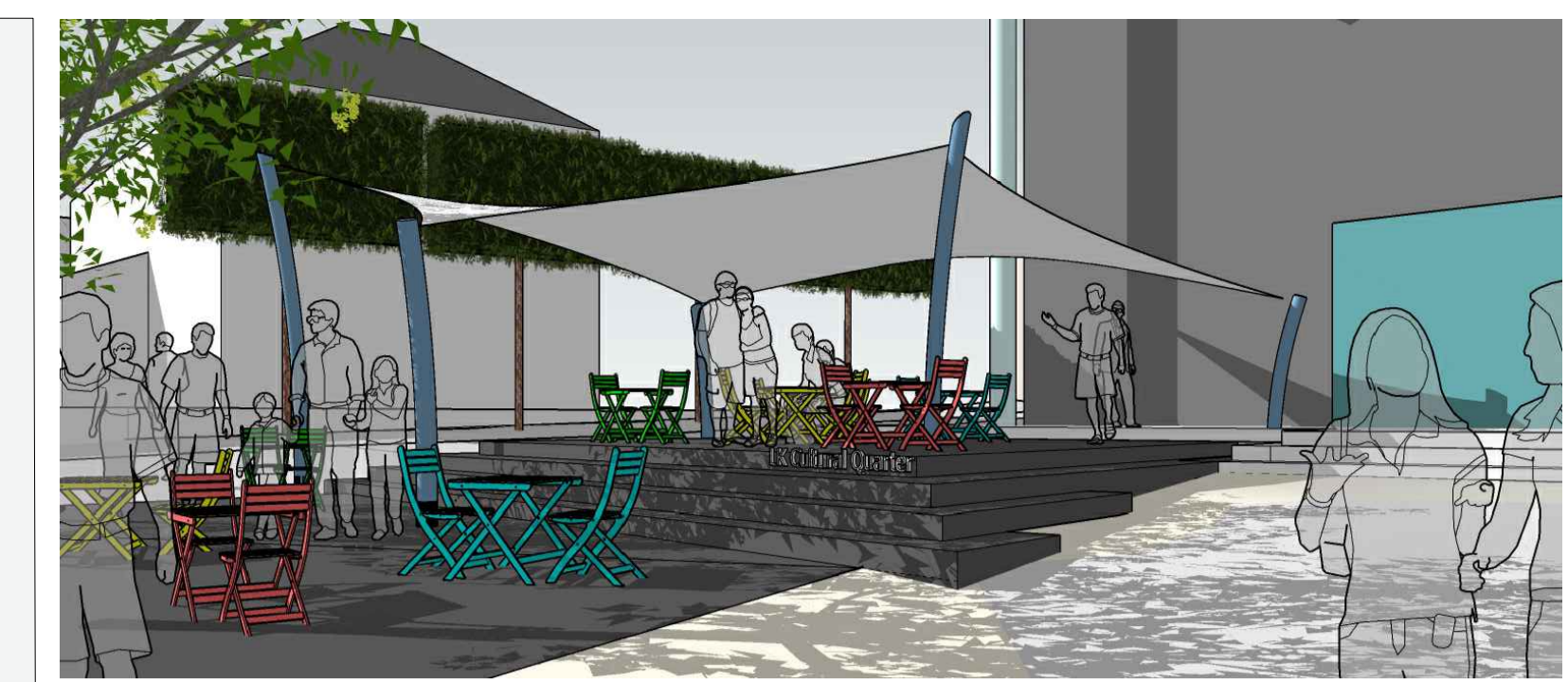
Illustrative Visualisation: View towards theatre showing raised seating area