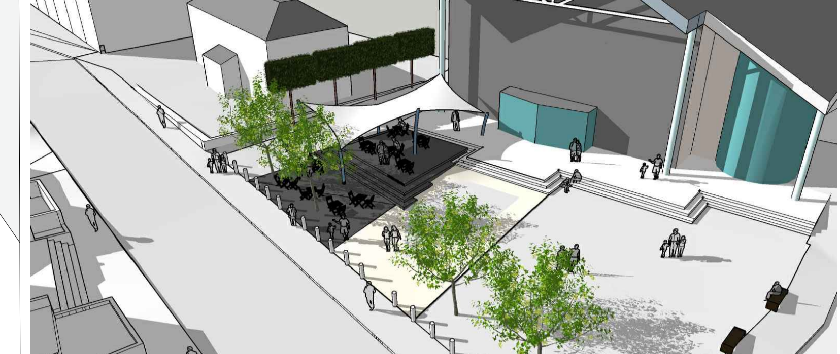
Illustrative Visualisation: Aerial view towards theatre