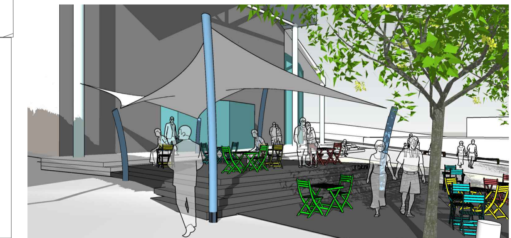
Illustrative Visualisation: Proposed raised seating area